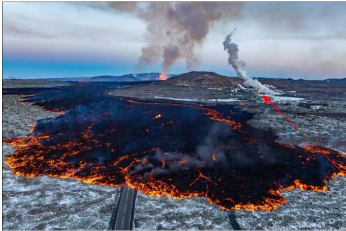
Site of current eruption

The ash was created as that volcano erupted under an ice sheet, but the southwestern part of Iceland does not have these, so the current eruptive activity will remain effusive and not be an issue for air travel. The photo below was taken in December 2024.