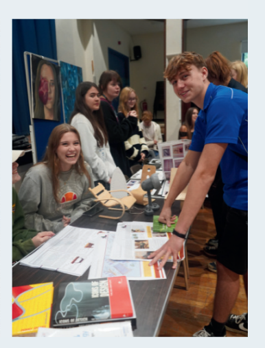
Community - Unity - Opportunity