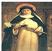
St Catherine of Siena (1347-1380)