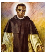
St Martin de Porres (1569-1639)