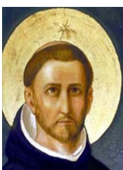
St Dominic de Guzman (1170-1221)