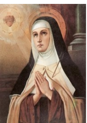
St Teresa of Avila (1525-1582)